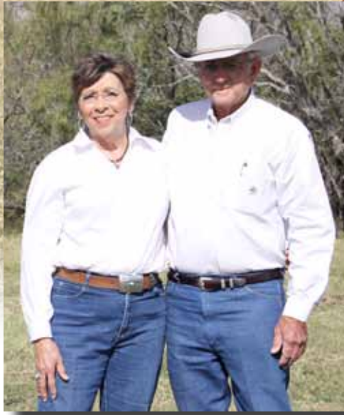
by Chel Terrell